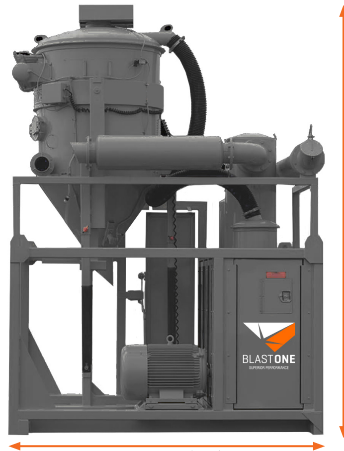
Length 3.63m (143")